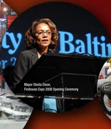
Mayor Sheila Dixon, Firehouse Expo 2008 Opening Ceremony