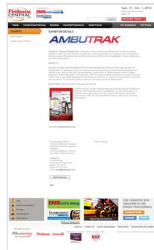
Virtual Booth sample

Add video to either option for only $250.