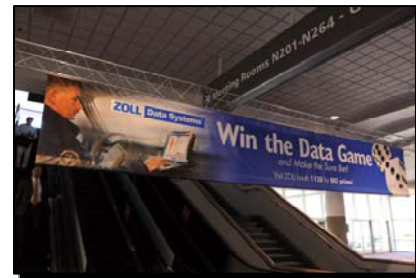
Company Sponsored Banner

Be one of the most visible promotions around the entire show as your banner hangs in a prominent location both inside and outside the exhibit hall in high traffic areas.