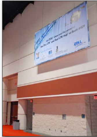
COMPANY SPONSORED BANNERS